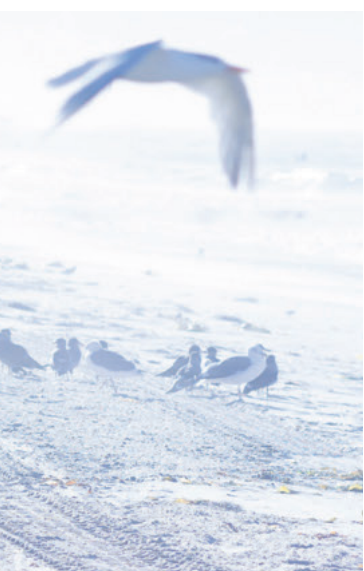
LA Surf club take an early morning walk on the beach.

Minors are offered by the College and two schools with undergraduate majors—the School of the Arts and Architecture and the School of Theater, Film, and Television. Professional schools that don't have undergraduate programs—Management, Education and Information Science, Public Health, and Public Affairs—offer minors to undergrads who want to explore these advanced fields. Minors such as “Food Studies” and “Disability Studies” are interdisciplinary programs designed by collaborating faculty from different fields of study.