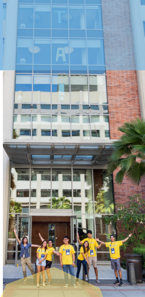
Residential Life student staff welcome new freshmen and transfers on Move In Day.

“ We often forget that we are so lucky to be taught by such accomplished people. My professors have provided guidance and encouraged me to pursue my passions. They have gone out of their way to help me succeed, and I am supremely thankful for it. ”